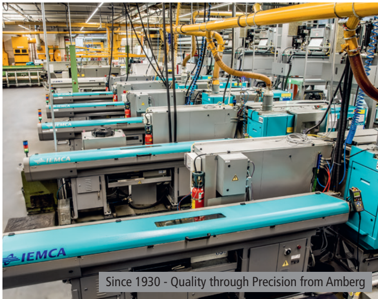
Since 1930 - Quality through Precision from Amberg